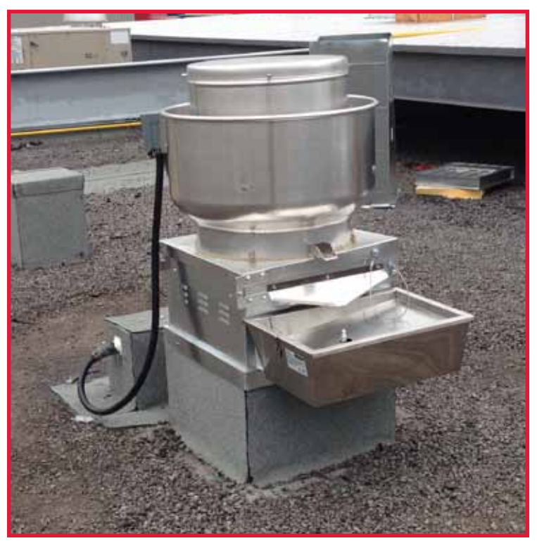
Model EFI-UB shown installed on fan

Unfortunately, many restaurant operators don't think about the serious damage that grease from their kitchen hood exhaust fan can do until it's too late. While NFPA-96 requires that all restaurants have a functioning grease trap for their exhaust fans, poorly designed grease traps can overflow. The resulting grease on the roof can cause catastrophic damage and presents a potential fire hazard. Clean up and repair of the roof can be very expensive, and if a fire occurs, insurance may not cover it.